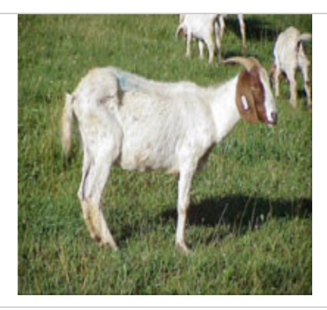
Loss of condition and rough hair coat(http://attra.ncat.org/attra-pub/parasitesheep.html)