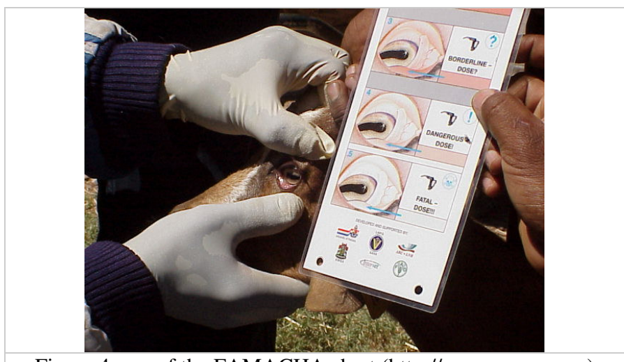
Figure 4. use of the FAMACHA chart (http://www.scsrpc.org)

Strategic deworming using a FAMACHA© card can be established in intensive farms in the Rift Valley where haemonchus is prevalent. FAMACHA© is a technique developed in South Africa that is used to identify anemic animals on a 1 to 5 scale. The system is based on examination of the lower eyelid of sheep and goats and comparison with the FAMACHA© color chart depicting varying degrees of anemia. This test is used to determine the need for anthelmintic treatment. Administration of treatment should follow only if anemia (a sign of parasitism) is present. The FAMACHA© card can be ordered through animal health input suppliers and training on how to use it can be obtained from veterinary professionals.